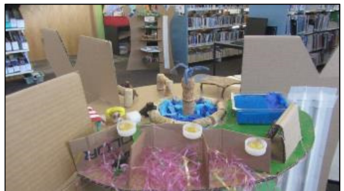
Pony Land - complete with a fountain, stables swimming pool hurdles, café and First Aid office made by Ebony, Alinta, Bonnie and Aleha